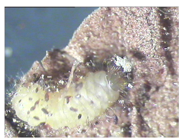
Figure 6 Larva

The larva is oligopod, with three pairs of short legs with light brown color.