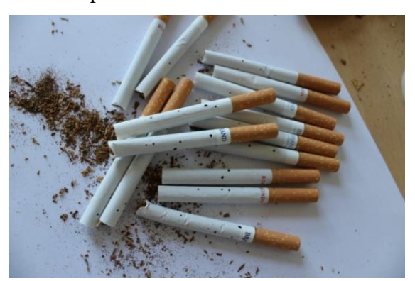
Figure 12 Damaged cigarettes

By rearing on cut tobacco, they damage and infest it with fecal materials, dead larvae, remains from changing and metamorphosis.