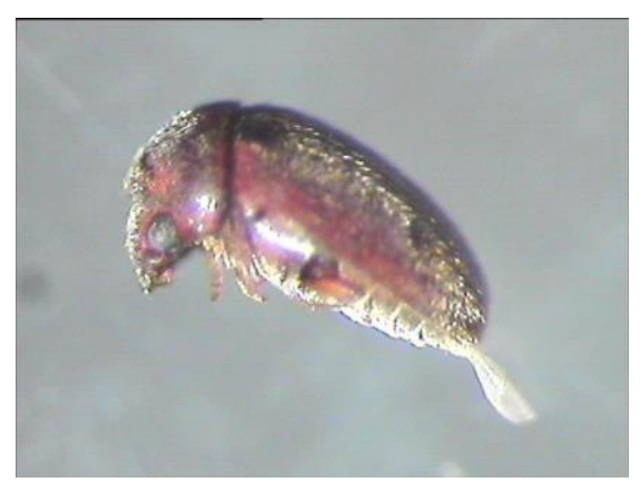
Figure 2 Imago- lateral view

The type is oviparous. Imagos copulate and the females lay the eggs on the