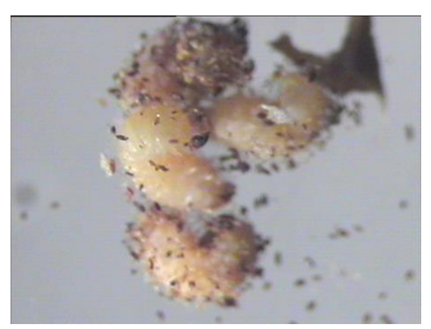
Figure 7 Larvae

They immediately feed from the material where they hatched.