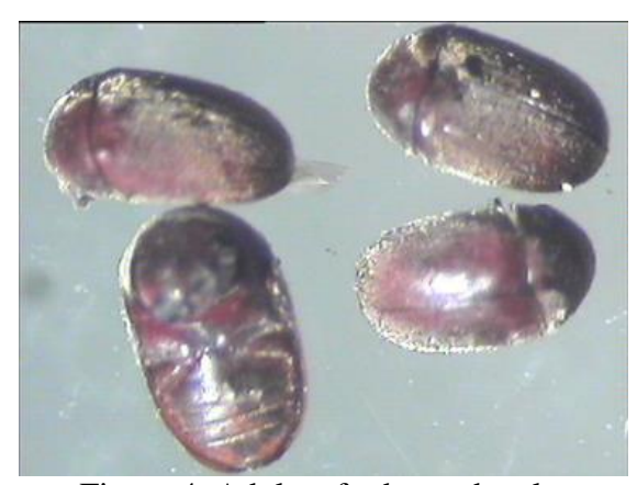
Figure 4 Adults of tobacco beetle

substrate in which the tobacco beetle lives and feeds.