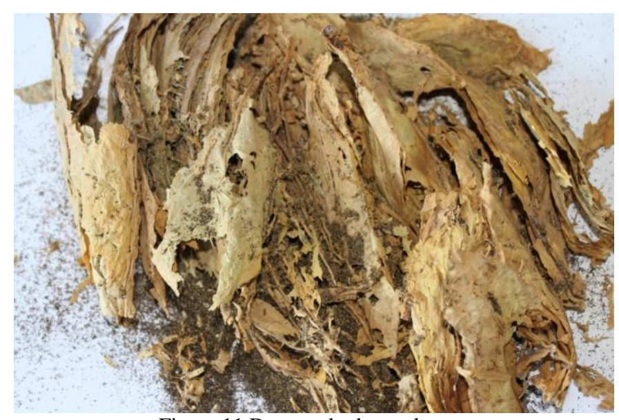
Figure 11 Damaged tobacco leaves

When the raw material attacked by tobacco beetle is stored for a longer period without any protection, during the opening of samples only dust and waste appear.