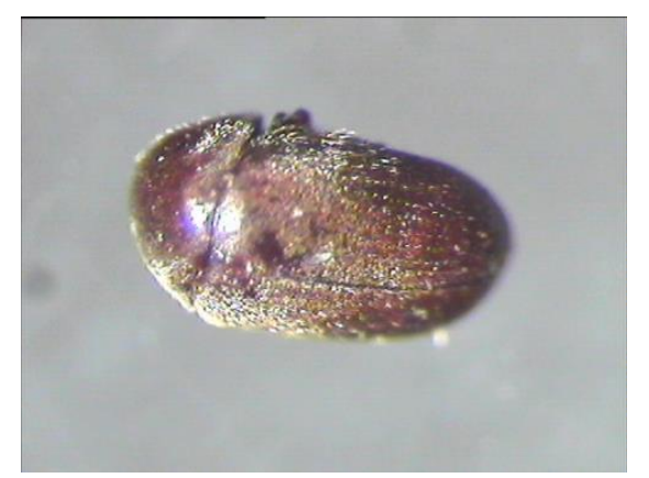
Figure 1 Imago- dorzal view