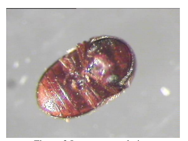
Figure 3 Imago- ventral view

The elytrae are arched and spread along the middle of the back, embossed, with many spots through the whole surface. The second pair of wings is membraneous, bent under the elytrae.