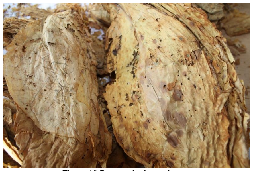
Figure 10 Damaged tobacco leaves

At first, it causes damage to the tobacco by making small holes. As it grows, larvae bite larger parts of dry leaves placed in layers one over another (figure 10, 11).