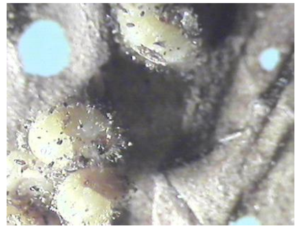
Figure 8 Larvae and damage

The development of larvae is affected not only by the temperature and humidity, but also by the type of food.