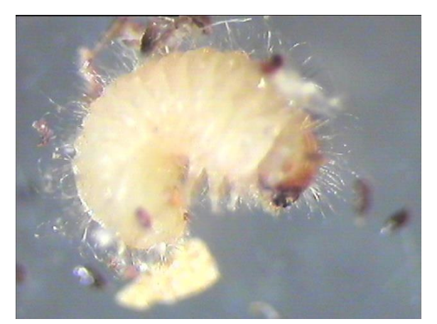
Figure 5 Larva after hatching

It is eucephalous, its head is chitinized, with brown color. Its jaws are darker, almost black, with triangular shape, with a slightly convex boundary externally, whereas the internal edge is serrated.