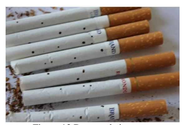
Figure 13 Damaged cigarettes

make round holes (figure 12, 13, 14). It rears on their contents, at the same time infesting them with its fecal materials, remains from changing and metamorphosis, which makes them inappropriate for smoking. When smoking such tobacco products, infested by tobacco beetle, one can sense a typical bad smell and taste.