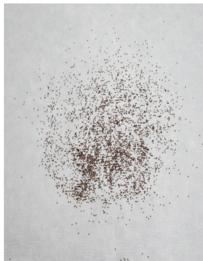
Photo 2. Tobacco seed from Pelagonec variety (adopted from Risteski, 2011)

makes this variety very attractive as well as for the producers and for the manufacturers. The seeds from this variety is very small, 0.085 g. per 1000 seed. (Photo. 2)