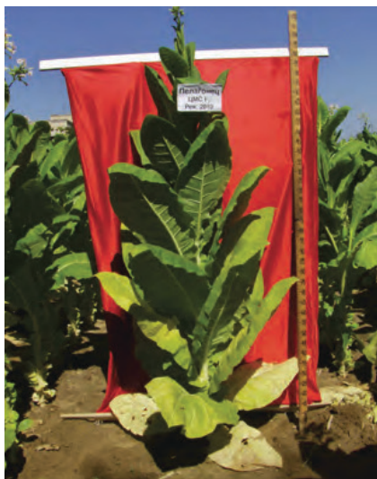
Photo 1. Burley variety Pelagonec