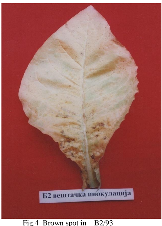
g.4 Brown spot in B2/93 – artificial infestation

The symptoms of brown spot in this variety in conditions of natural and artificial inoculation are presented in Fig. 3 and 4.