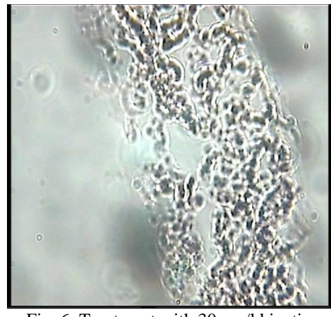
Fig. 6 Treatment with 30 mg/l kinetin