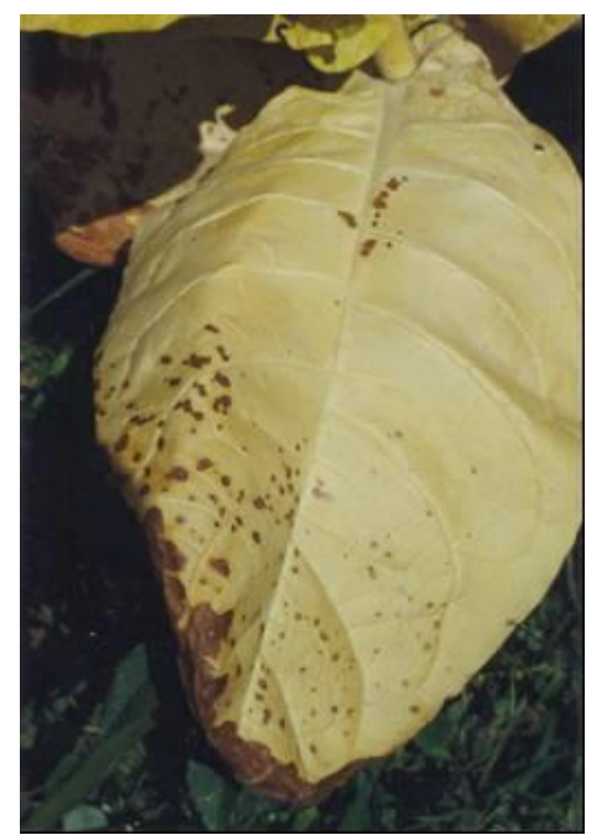
Fig. 3 Brown spot in B2/93 -natural infestation

This pathogen has a wide range of hosts. It attacks almost all types of tobacco and all the varieties are, more or less, susceptible. Still, the large-leaf varieties are subject to greater intensity of attack than the oriental and semi-oriental varieties. Among the large-leaf varieties, higher intensity of