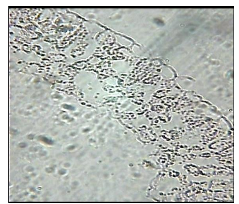
Fig. 5 Tobacco leaf - untreated plants

Similar statements were reported by Perez et al. (1995) in the treatment with giberellic acid. They claim that there is no direct effect on the pathogen, but rather physiological one, delaying senescence or healing wounded tissue.