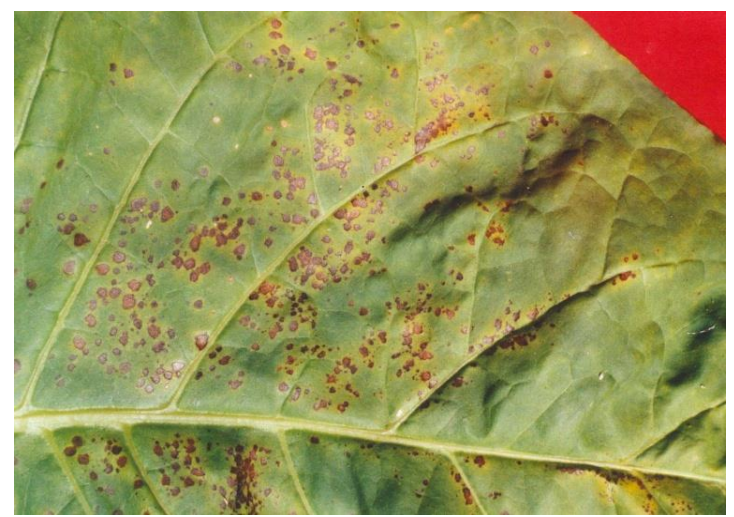
Fig 1. Symptoms of brown spot disease in large-leaf tobacco

area. In case of severe attack, irregular angular areas are formed and the infected tissue becomes stiff and falls off. These symptoms indicate that the tissue has undergone biochemical changes which deteriorate the quality of raw tobacco.