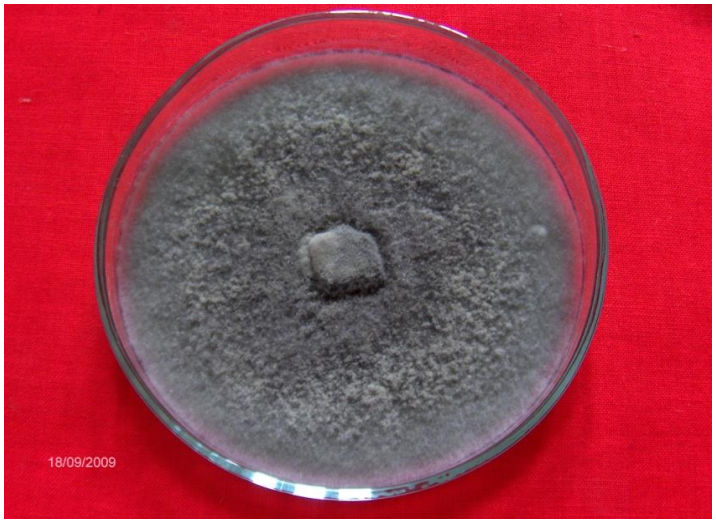
A. alternata – pure culture