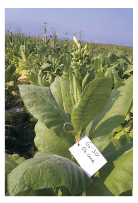
Photo 4 Tobacco plant prior to treatment of floral bud for chemical topping