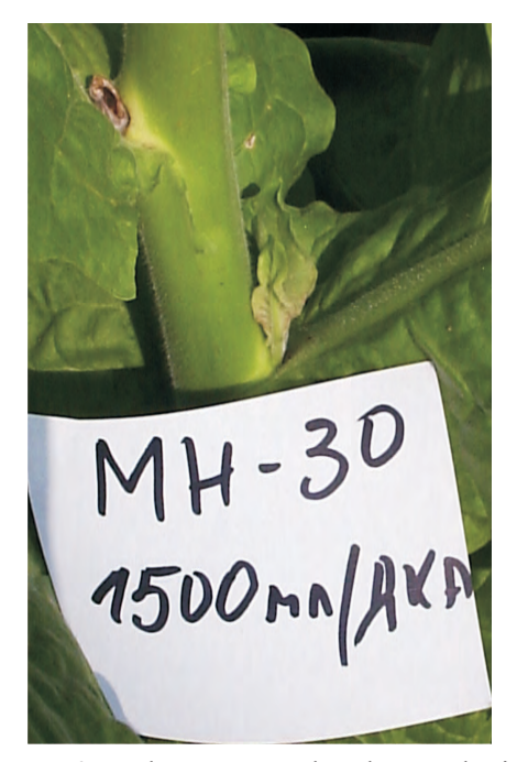
Photo 2 Tobacco topped and treated with Royal MH-30 with 1500ml/dca - 20 days after treatment