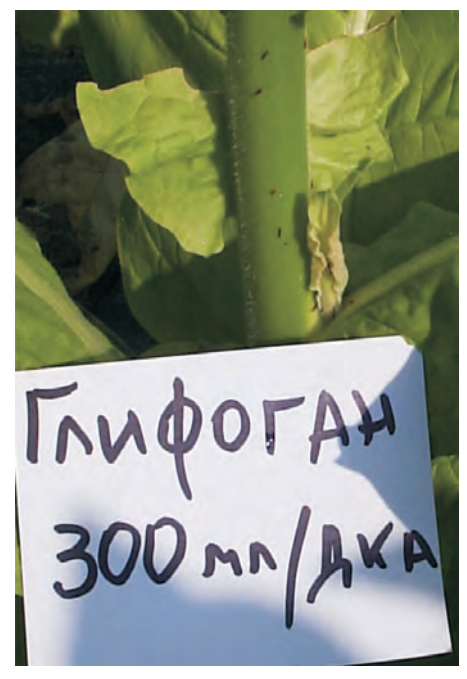
Photo 1 Tobacco topped and treated with Glyphogan 480 SL with 300ml/dca - 20 days after treatment